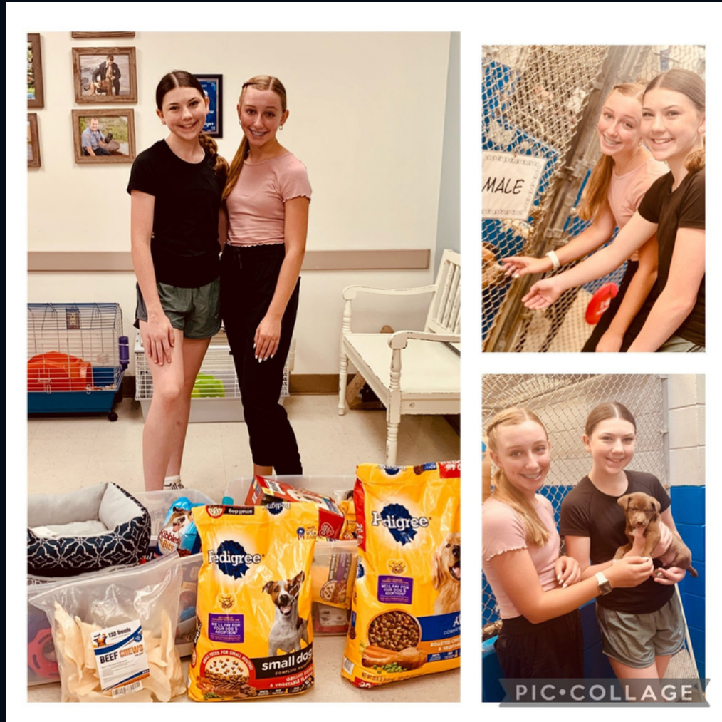
SOF Lumberton PC members delivering animal supplies to a local shelter.

Additional information will be sent out as Monthly Missions are determined.